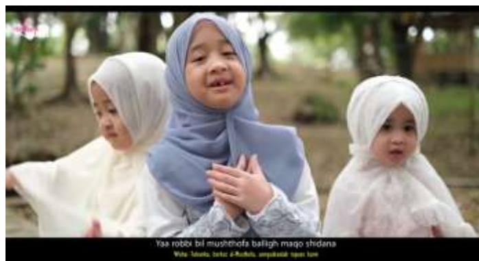
Fig. 5. Children's Islamic Song

Based on this description, it can be concluded that two supporting reasons make millennial parents choose the program to sing Islamic songs with children as one of the roles they play to internalize Islamic values in children. The first supporting reason is cooperation with kindergarten teachers. This is by the findings of (2019), which state that instilling character values in children requires the role and cooperation between parents and teachers. The second supporting reason is that children enjoy listening to these Islamic songs. Khoiruddin (2016) states that teaching early childhood must begin by making him feel happy and comfortable first so that the child does not feel burdened by the treatment given.