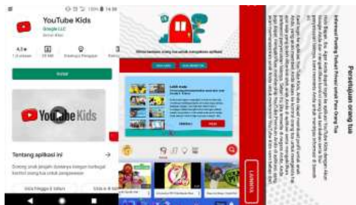
Fig. 3. Youtube Kids View

Based on this description, it can be concluded that millennial parents show an active role in internalizing Islamic values in their children. They do this because they realize that gadget media will only be effective when used to a certain level or limit, more than that, it will harm children. This follows Sahriana's (2019) findings, which state that the role of parents in managing and controlling the use of gadgets in children is an aspect that must be fulfilled to obtain a positive impact from the use of gadgets in children. Furthermore, Hidayati (Hidayati 2020) states that parents must be able to communicate well with children about restrictions on the use of gadgets to help overcome gadget addiction in children.