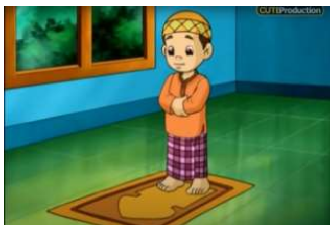
Figure. 5. Prayer Animation Video

"My child is now starting to be able to follow the prayer movements and readings because I invite him to watch prayer videos at least once a day" (Interview 10. DKY. 11 December 2021).