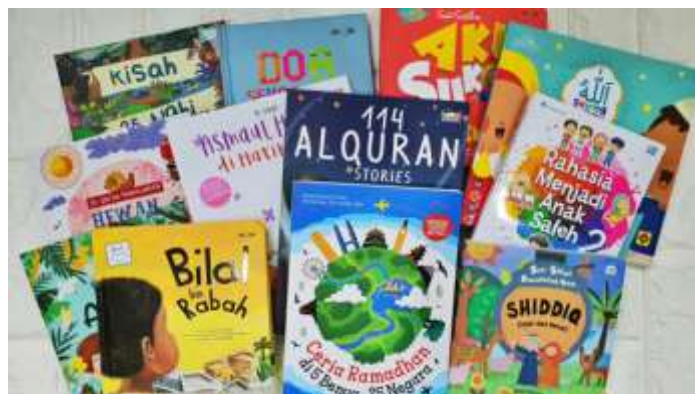
Figure. 4. Islamic Story Book

Based on the data description, it can be concluded that the use of Islamic storybooks to internalize Islamic values in children is supported by the display of content or animation in storybooks that attract children's attention. This follows Lubis & Dasopang's (2020) opinion, which states that one of the elements that must be considered in developing a picture storybook is exciting content and animation. Furthermore, Afrida & Fitriani (2016) stated that the appearance of attractive animations in picture storybooks could increase children's reading interest.